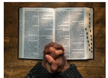
Study the Bible.