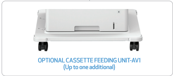
OPTIONAL CASSETTE FEEDING UNIT-AV1 (Up to one additional)