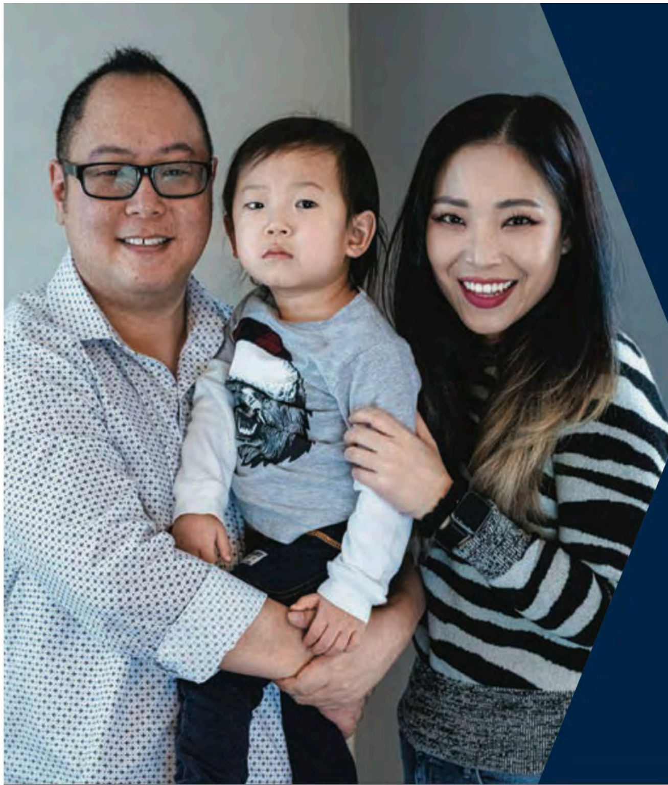
SURH FAMILY PHOTO

Bible Studies for Life Preschool Enhanced CD (Printables), Fall 2025