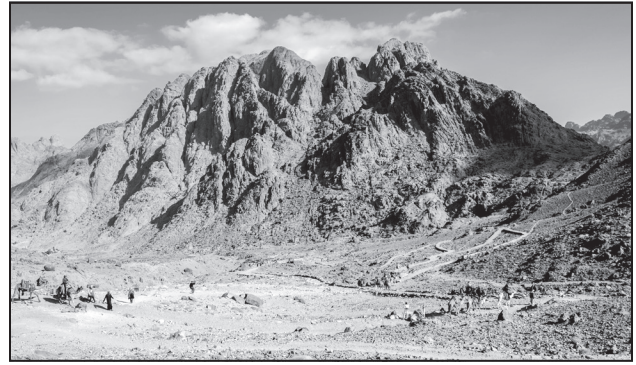
Mount Sinai in Egypt

The difficulty is that no one knows exactly where the particular mountain is located. One mountain in the southern end of the peninsula, though, has been identified as Mount Sinai since the fourth century AD. According to the book of Exodus, Moses ascended and descended Mount Sinai seven times 1 during the Israelites' encampment at its base. These repeated journeys underscore the mountain's spiritual significance and the intensity of Moses's communion with God.