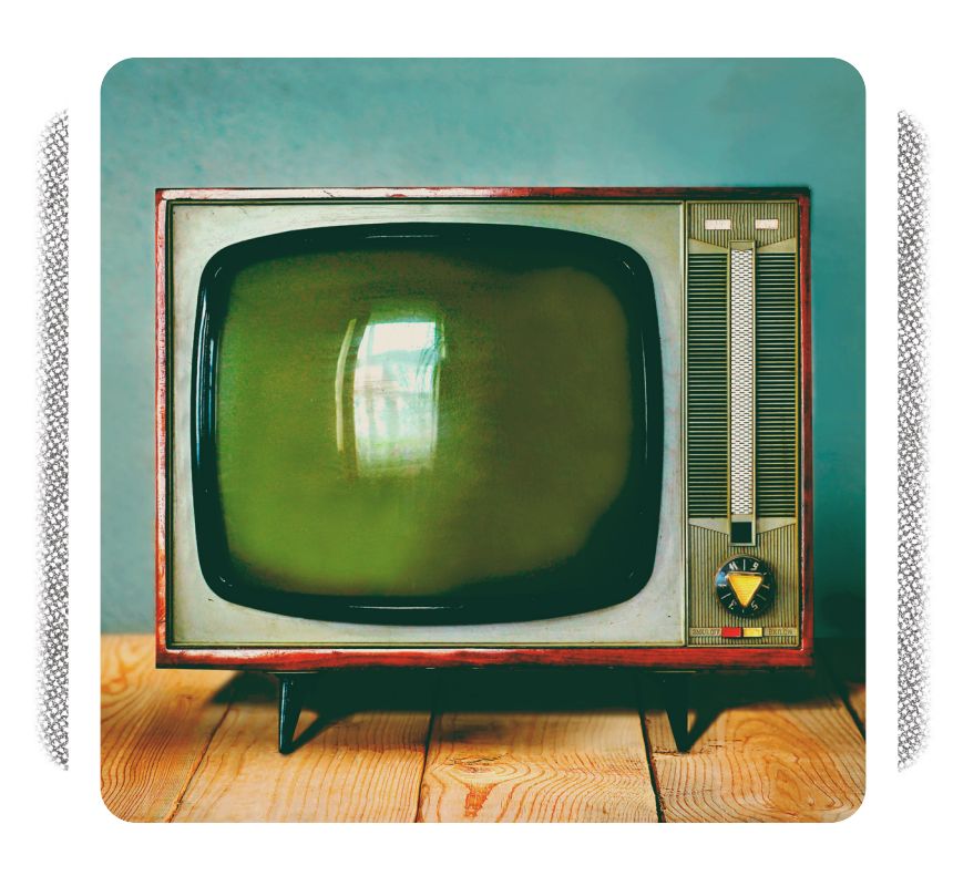
What's your favorite friendship from TV or movies?