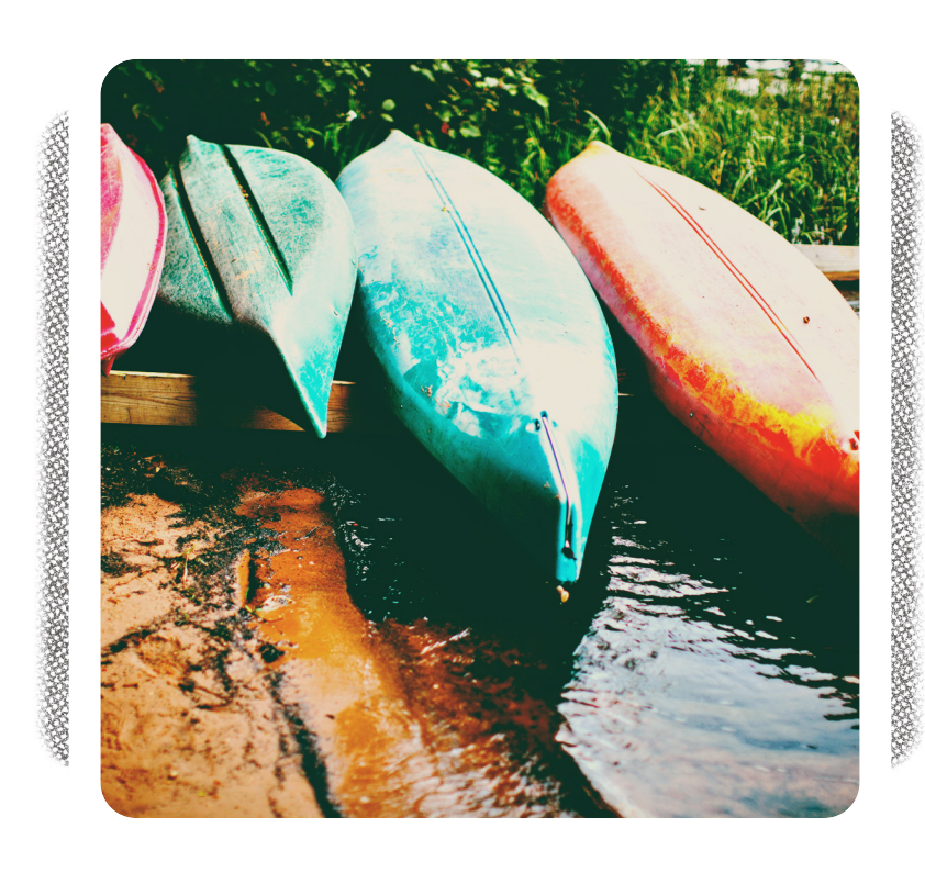
What's your favorite way to spend a day off?