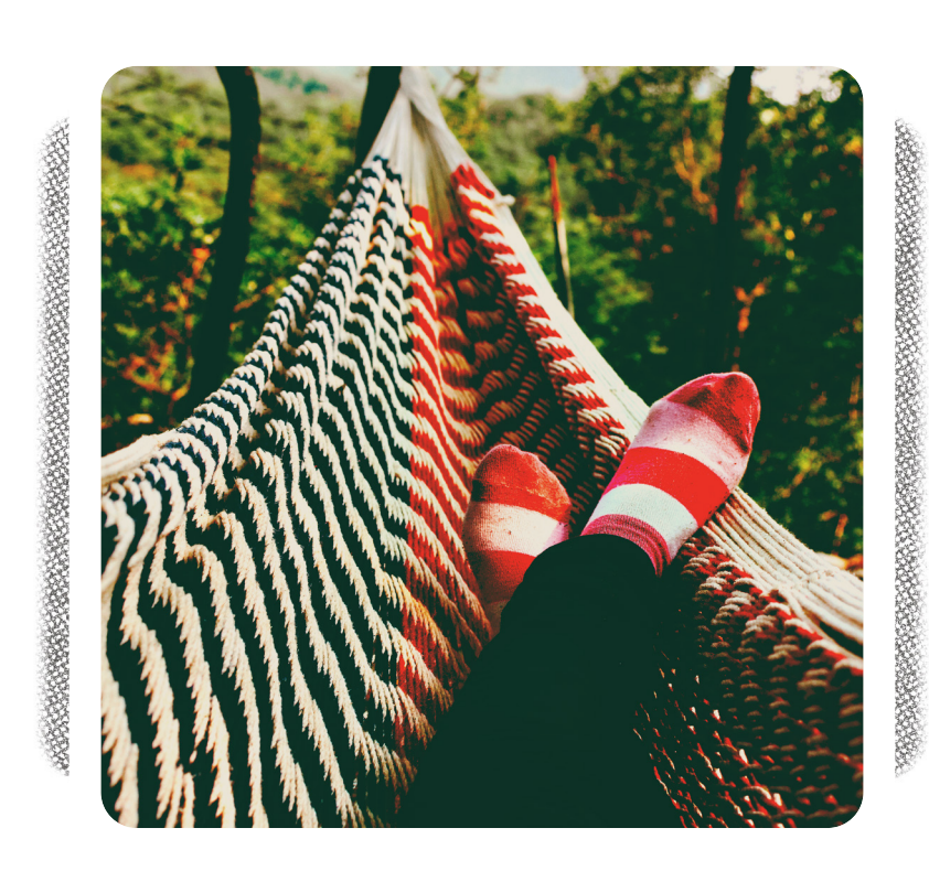
What makes you feel especially content?