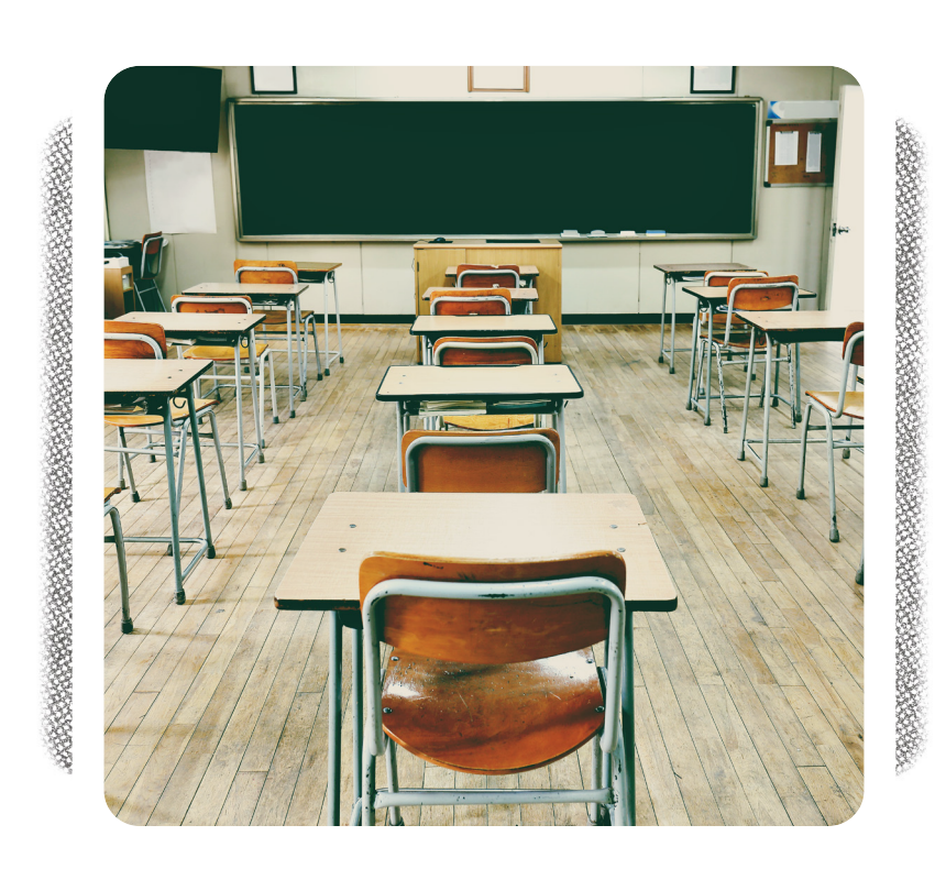
What are some things you never worry about anymore?