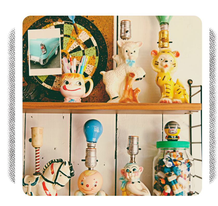
What did you enjoy collecting as a kid?