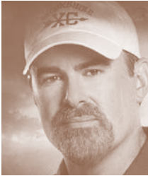
AFFIRM Films A Sony Company © 2019 CTMG.